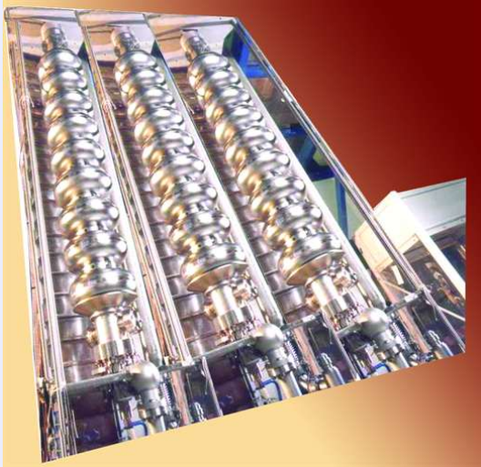
In-Photonic transmission plasma laser technology